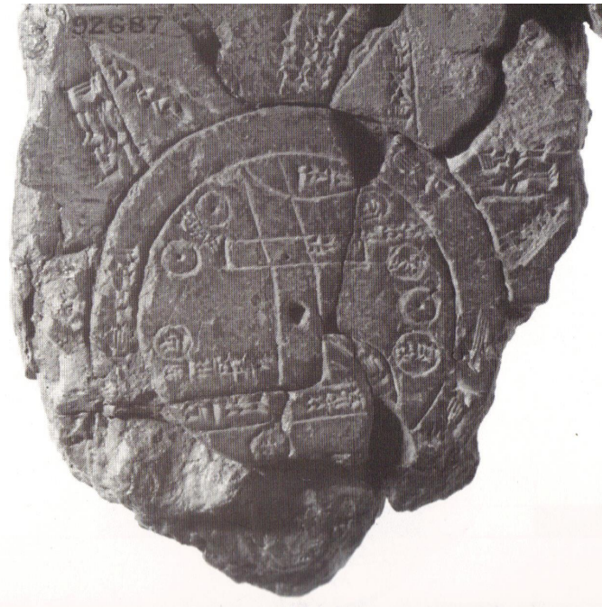
Fig. 1: The World Map: Photograph 3

My text is BM 92687, more commonly known as The Babylonian Map of the World . This is a British Museum tablet from the vicinity of Babylon dating to the middle of the first millennium BCE that I myself have now published three times in Mesopotamian Cosmic Geography (the Ph.D. thesis, the first printing in 1998, and second printing in 2011). 2